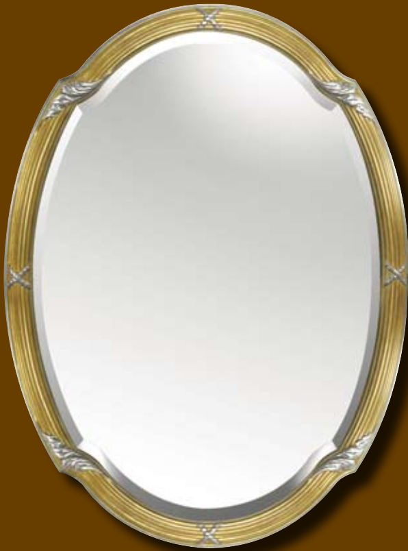
NO. 2204-132 26 1/2" X 35 1/2" ANTIQUE GOLD / SILVER