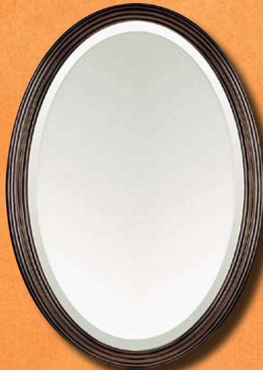
No. 2002-182 22" x 32" ANTIQUE BRONZE