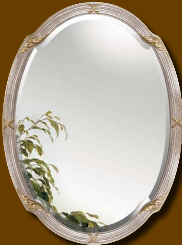
NO. 2204-172 26 1/2" X 35 1/2" SATIN NICKEL / GOLD