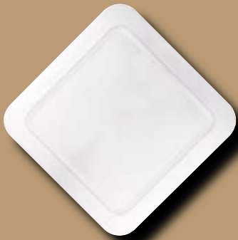
No. 9283-102 (TWO GREAT OPTIONS FOR MOUNTING) 28" x 28" SQUARE/RADIUS CORNERS