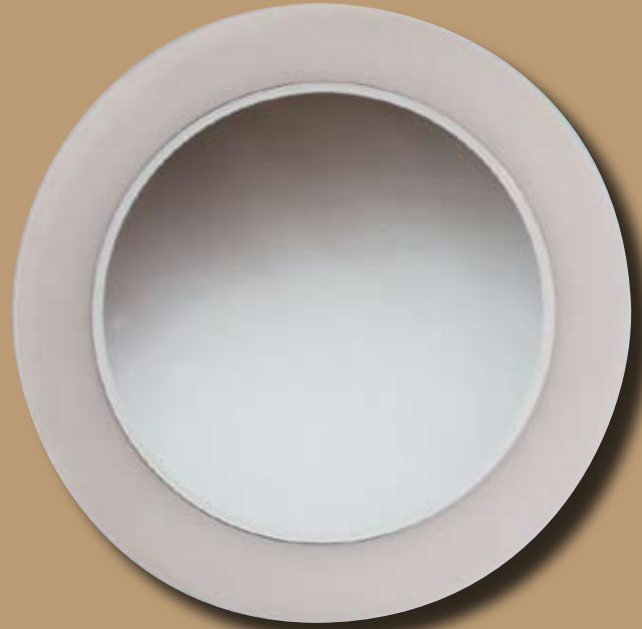
NO. 2541-512 24" DIAMETER MIRROR ON FROST WHITE