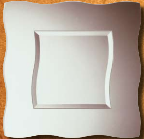
No. 2509-102 22" x 22" MIRROR ON MIRROR