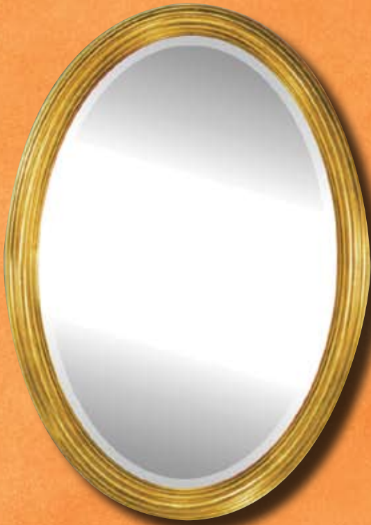
No. 2002-122 22" x 32" ANTIQUE GOLD