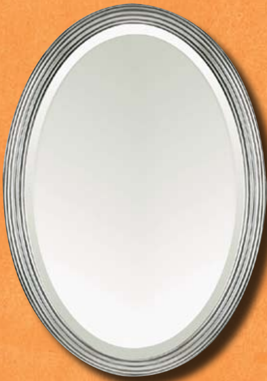
No. 2002-152 22" x 32" ANTIQUE PEWTER