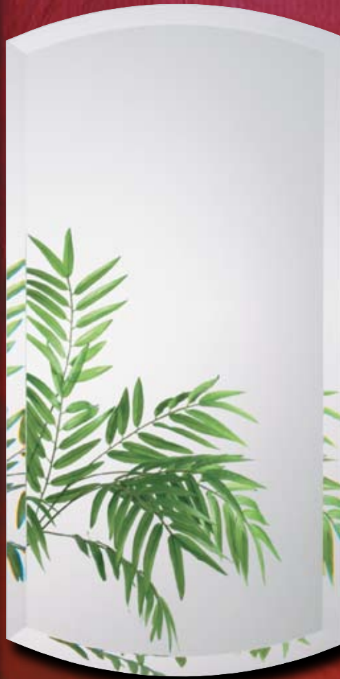
No. 9378-102 15 1/8" x 30" BEVELED ARCH