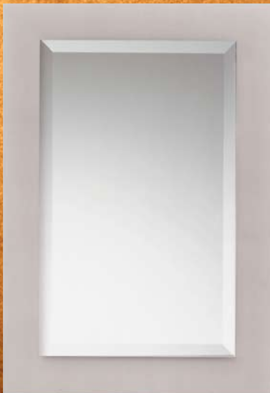
NO. 2528-112 16" X 24" MIRROR ON FROST WHITE