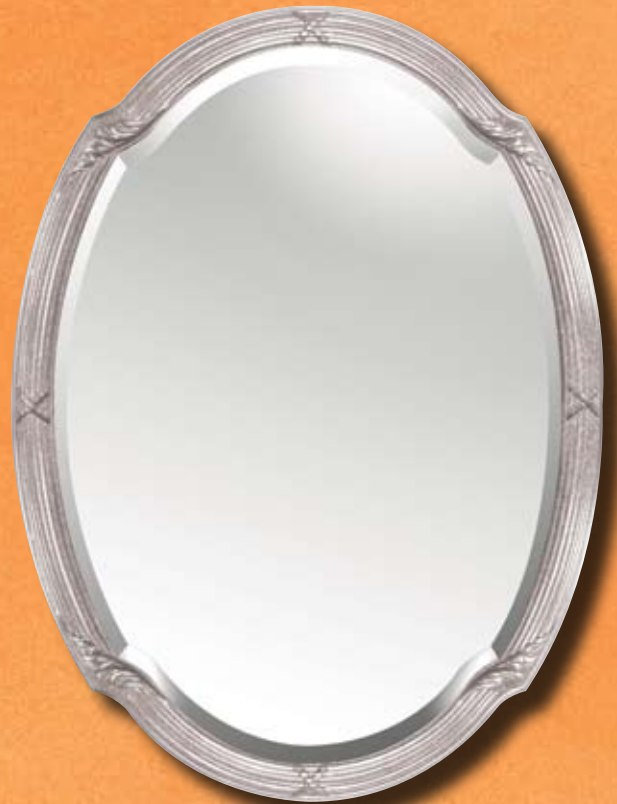
NO. 2204-142 26 1/2" X 35 1/2" SATIN NICKEL