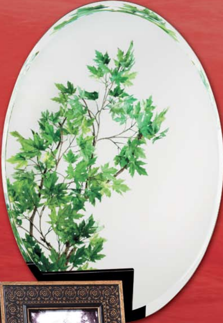
9564-202 21 1/4" x 31 1/4" TAPERED BEVEL