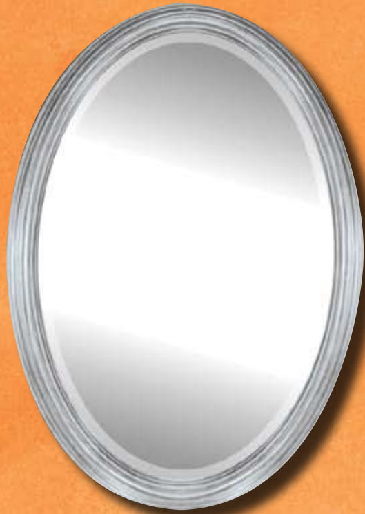
No. 2002-142 22" x 32" SATIN NICKEL