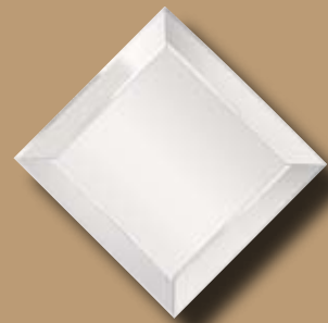
NO. 2640-101 (TWO GREAT OPTIONS FOR MOUNTING) 23 1/2" x 23 1/2" SQUARE/DIAMOND