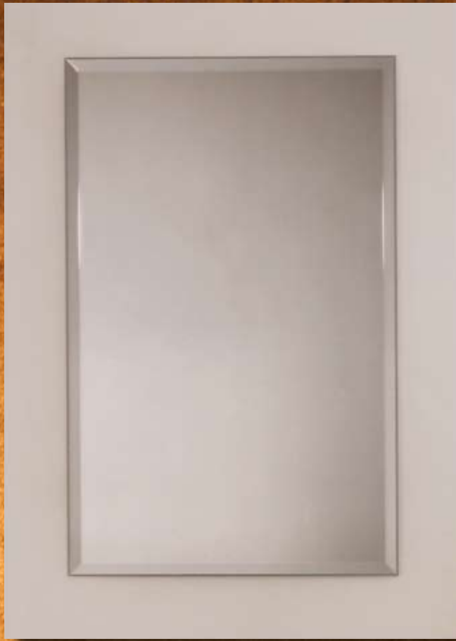
NO. 2524-112 25" X 35 1/2" MIRROR ON FROST WHITE